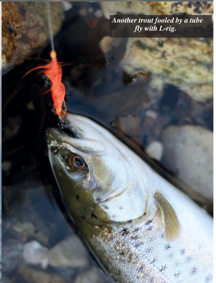
Another trout fooled by a tube fly with L-rig.