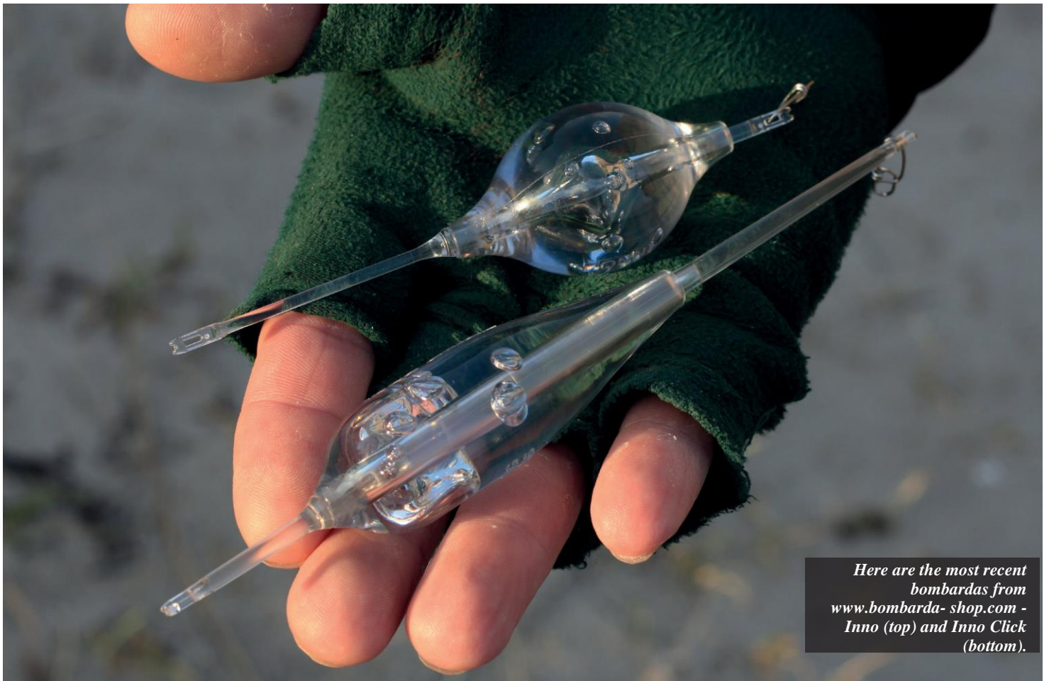
Here are the most recent bombardas from www.bombarda-shop.com - Inno (top) and Inno Click (bottom).