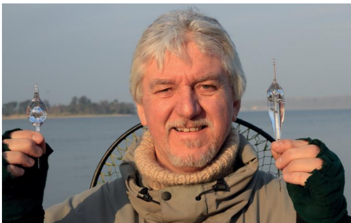
One characteristic of the Inno bombardas is that they cause very little snarling which makes them the perfect choice for the inexperienced coastal anglers.

INNO BOMBARDA was then introduced by Martin five years ago after long consideration. Thanks to its aquadynamic shape, this float retains retrieval depth even at quick retrieval – and only extremely rarely is the lead caught by the →